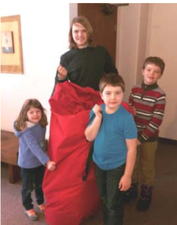
We had some hearty helpers to help green the church on December 17.