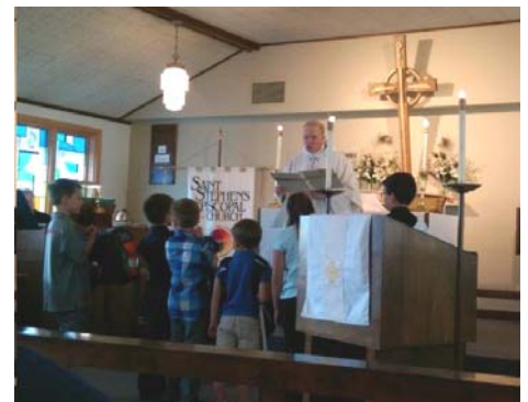
Blessing of Backpacks